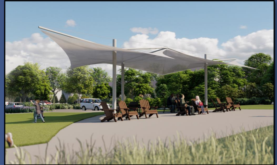
Play Area, Public Restrooms, Shade Structure, Lawn Areas