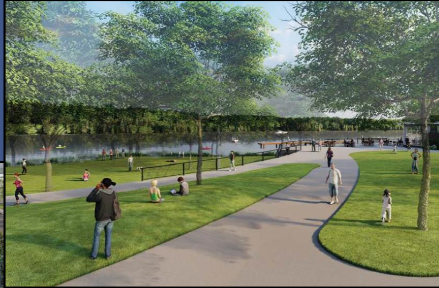
Sidewalks, Multimodal Pathway, Lawn Space