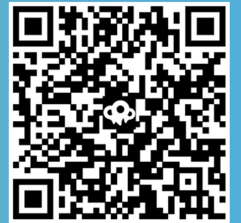
Business / Organization Survey