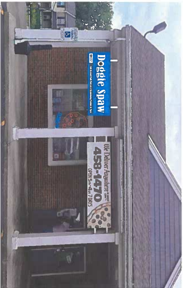
Storefront Sign Panel 84" x 30"